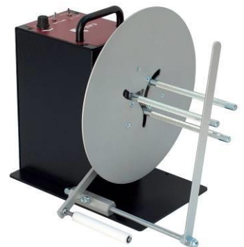
CAT-3-TA-ACH with APG

S-100 or S-200 Label Slitters. Reliable, high quality and maintenance-free.